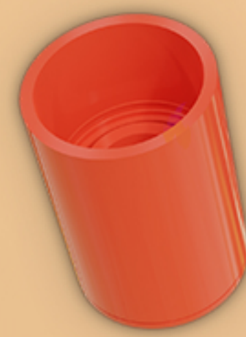
JOINTING SOCKET with CAPILLARY ADAPTOR