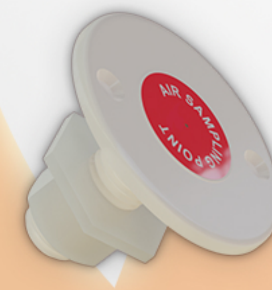
ABS012F FLUSH HEAD M16 PLASTIC NUT