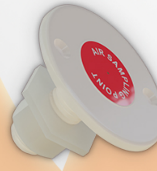
ABS012F FLUSH HEAD M16 PLASTIC NUT