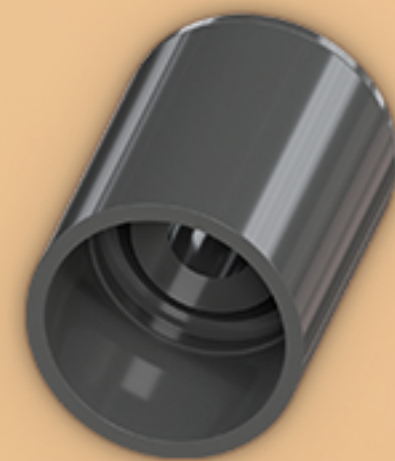
JOINTING SOCKET with CAPILLARY ADAPTOR