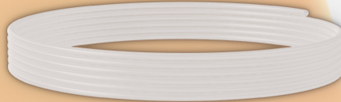
10mm NYLON TUBING STANDARD LENGTH 2m