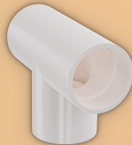
TEE ADAPTOR with CAPILLARY ADAPTER