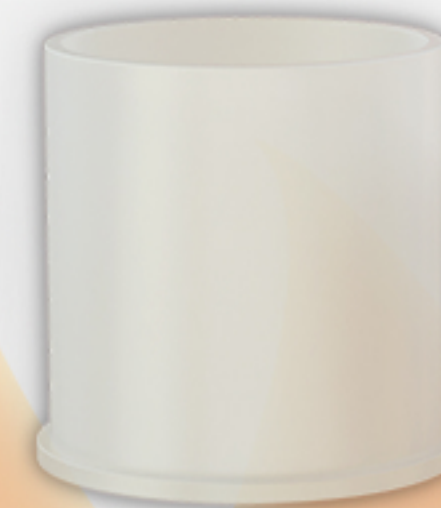
DISCRETE END CAP