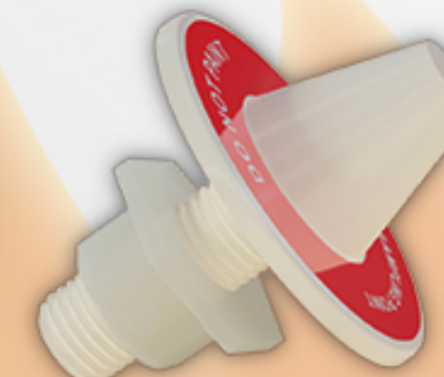
ABS011C CONICAL HEAD M16 PLASTIC NUT