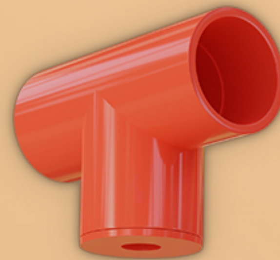
TEE ADAPTOR ABS022/27