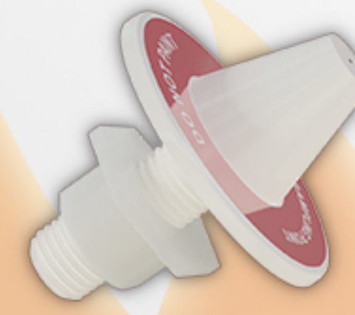
ABS011C CONICAL HEAD M16 PLASTIC NUT