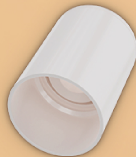
JOINTING SOCKET with CAPILLARY ADAPTOR