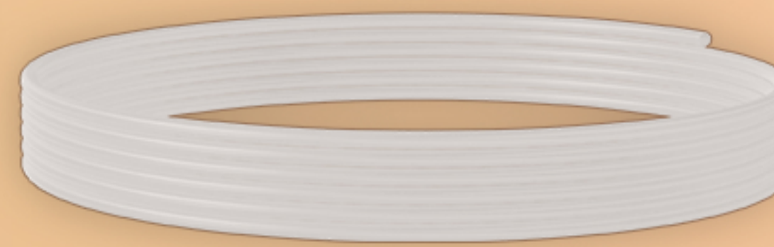
10mm NYLON TUBING STANDARD LENGTH 2m