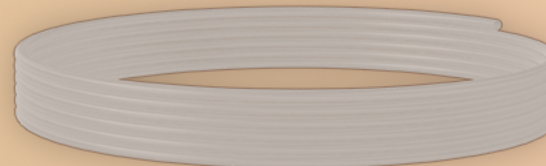
10mm NYLON TUBING STANDARD LENGTH 2m