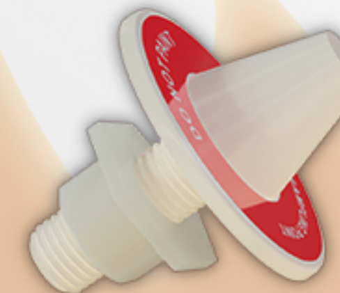
ABS011C CONICAL HEAD M16 PLASTIC NUT